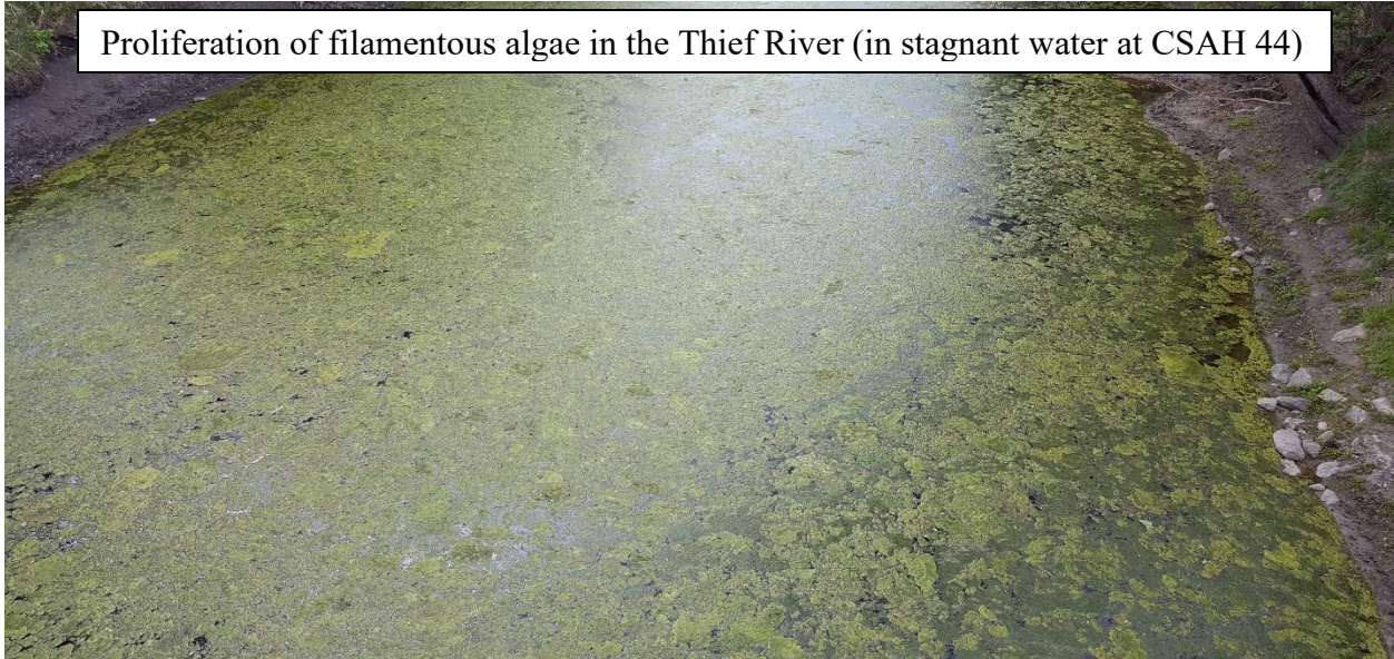
Proliferation of filamentous algae in the Thief River (in stagnant water at CSAH 44)