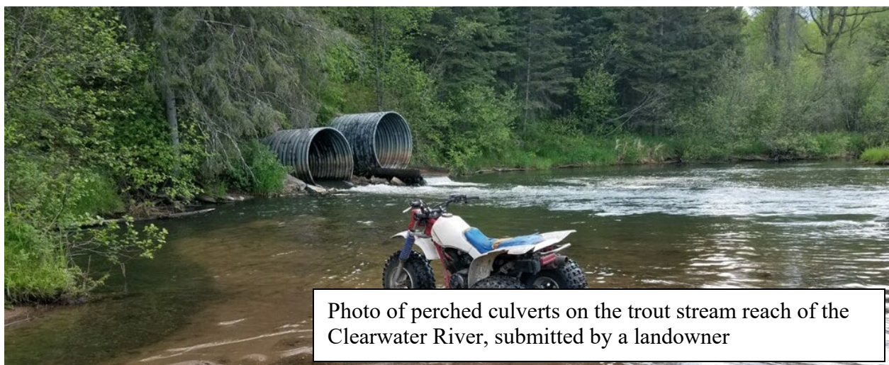
Photo of perched culverts on the trout stream reach of the Clearwater River, submitted by a landowner

District staff conducted groundtruthing of Clearwater River Watershed PTMApp burnlines (representing culverts and bridges) and edited PTMApp input files using the findings. A section-by-section examination of flow accumulation lines and non-contributing areas (areas where water digitally “pools” instead of flowing downstream) to find locations that should be field-checked for the presence/absence of a culvert. Houston Engineering staff completed a quality check on the hydroconditioning work that had been completed through May. In their opinion, the hydroconditioning work completed for the Clearwater River watershed might be the best in the state. They shared the results of an analysis that highlights portions of subwatersheds that were changed by the hydroconditioning process (comparison of USGS HUC-12 boundaries and new subwatershed boundaries delineated by PTMApp with hydro-corrected LiDAR data). They also provided a layer of points where they thought that additional ground-truthing would be beneficial. District staff used those layers to complete another desktop examination of the watershed and add points to the groundtruthing “to-do list.”